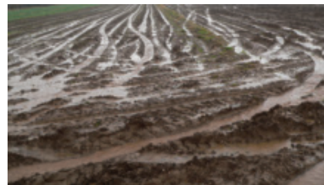
wheelings (following harvest or on tramlines, or created when feeding stock)