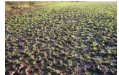
compacted grassland (e.g. where the soil is poached by out-wintering stock)