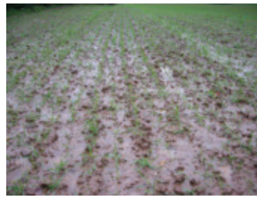
poor seedbeds where the soil is compacted or capped